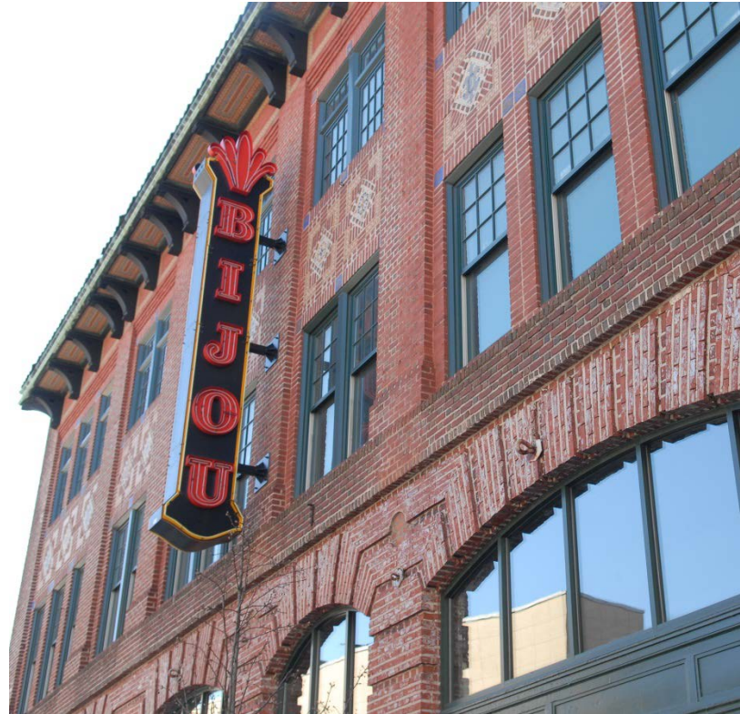
Bijou Theatre in Bridgeport, CT

NDC identifies, secures, and structures public and private financing and develops projects from concept to completion