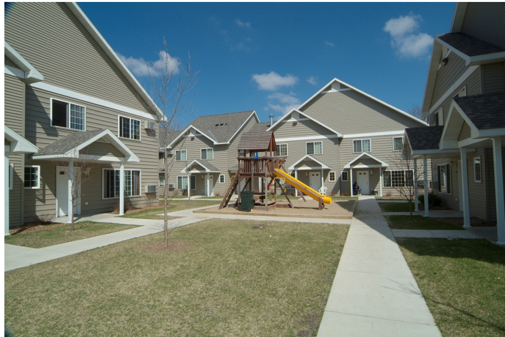
Dublin Road Townhomes in Mankato, MN

As an equity investor, NDC finances affordable housing, historic preservation, and clean energy installations